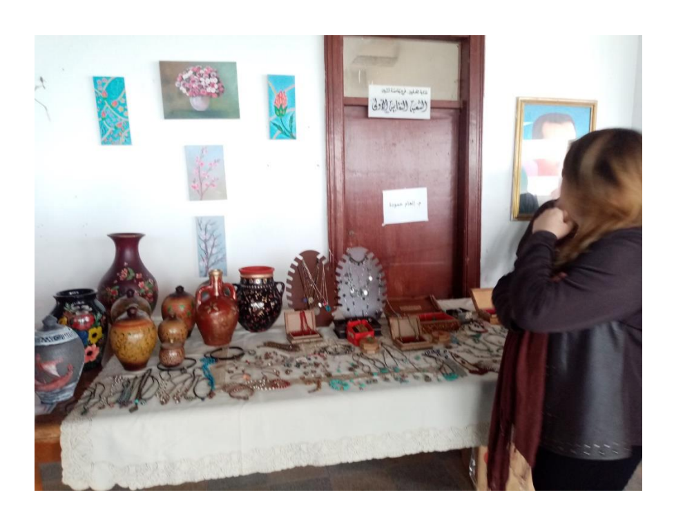
Fig 14: exhibition of the workshop 10