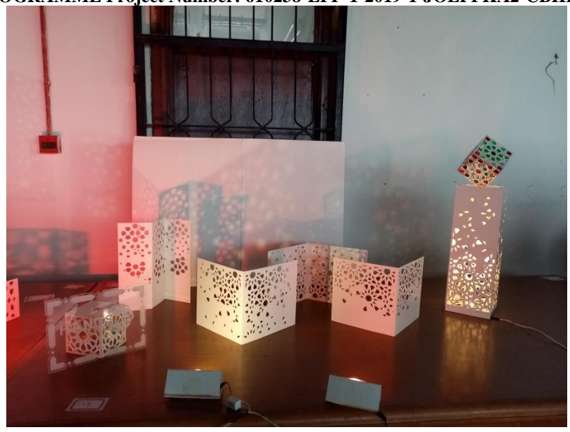
Fig 13: exhibition of the workshop 9