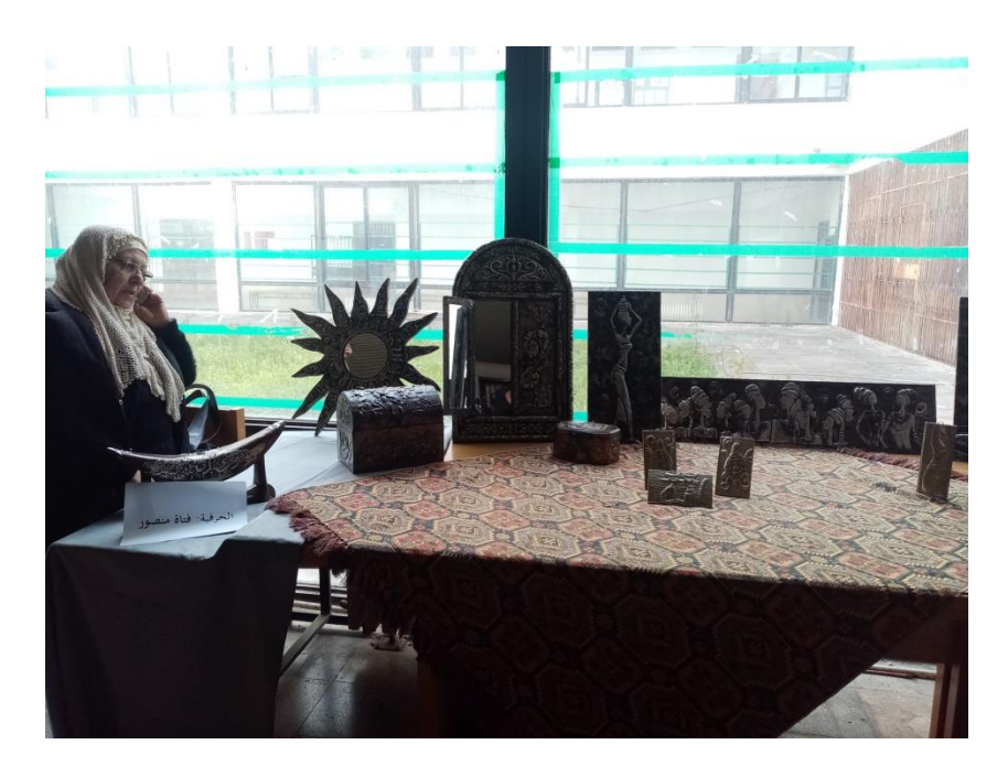
Fig 11: exhibition of the workshop 7