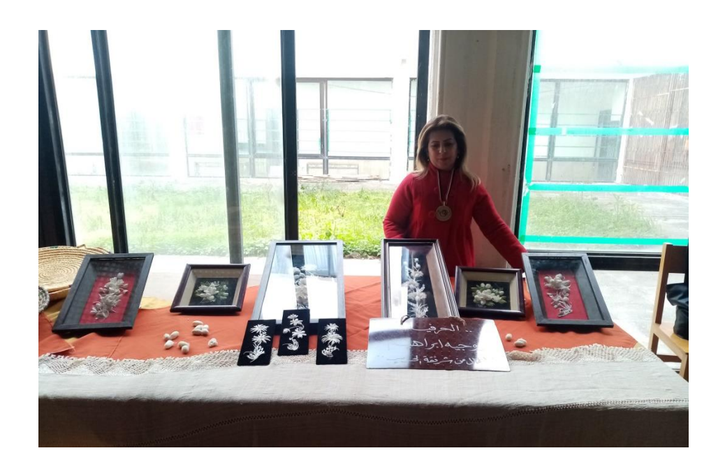
Fig 10: exhibition of the workshop 5