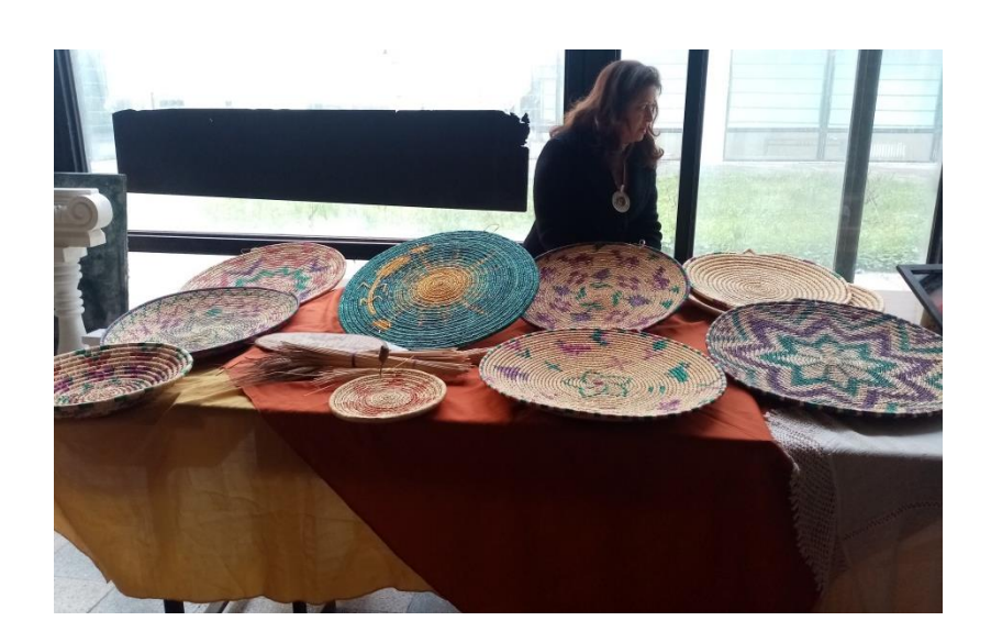
Fig 12: exhibition of the workshop 8