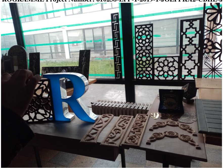
Fig 9: exhibition of the workshop 4