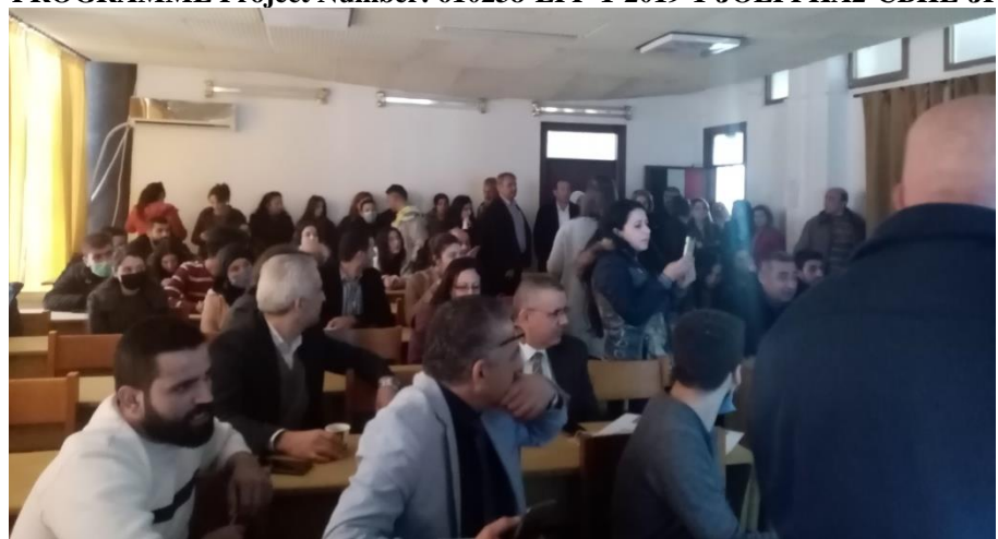
Fig 5: audience