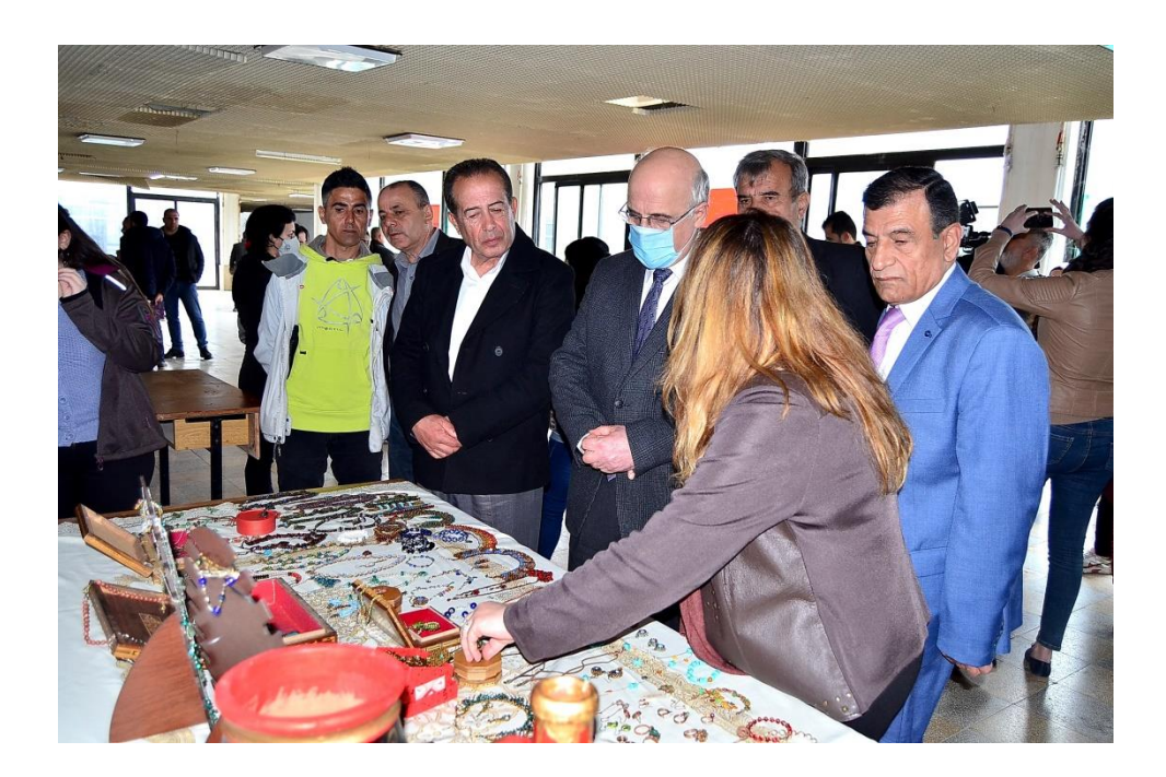
Fig 6: exhibition of the workshop 1