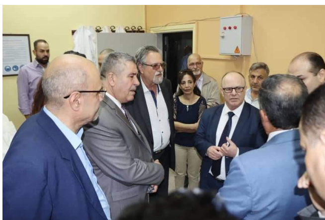
Workshop of Traditional Craft 2023

Under the auspices of the Minister of Higher Education and Scientific Research, and in the presence of the President of the University, gentlemen invited from the university presidency, the party branch, faculty members, craftsmen, beneficiaries, and students, everyone went to visit the traditional crafts workshop, a gift from the European Union program and the sponsorship of Al-Zaytoonah University of Jordan. Equipment and methods of use and how to transfer technology in the field of heritage of traditional crafts were reviewed. Among these equipment is a group of pottery formations and its furnace, as well as equipment for dealing with wood such as saws, lathes, and smoothing devices. As well as a unit dealing with metal, plastic and wooden sheets, and a three-dimensional printer to form plastic figures in preparation for converting them into forms of bronze, copper and iron.