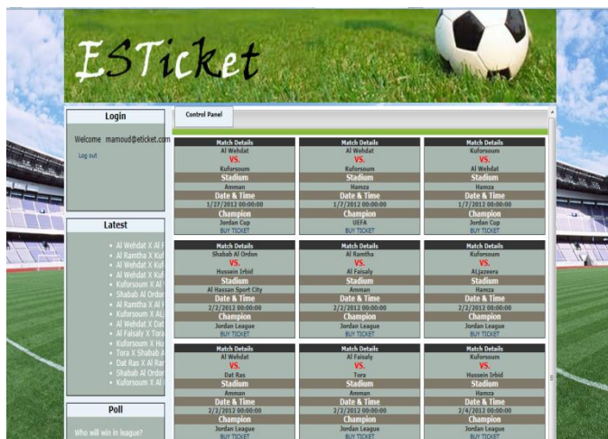
Home Page (User)

When the user selects his destination (the match they want) what it is only a click on the link to buy the ticket at the bottom of each match and the pressure on him to be transported automatically to the ticket reservation page.