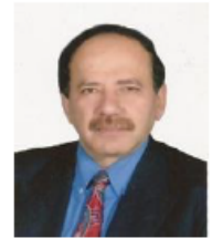
(+ Corresponding author)